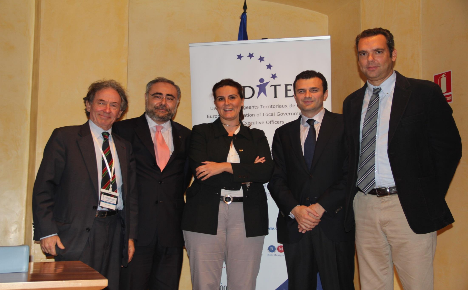
UDITE bi-annual congress– the start of the Spanish Presidency - November 2012 - Cadiz